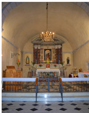
Interior of the Parish Church