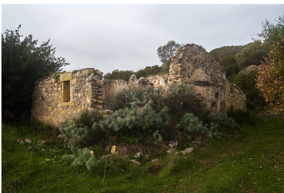
San Quirico. Lateral view of the building