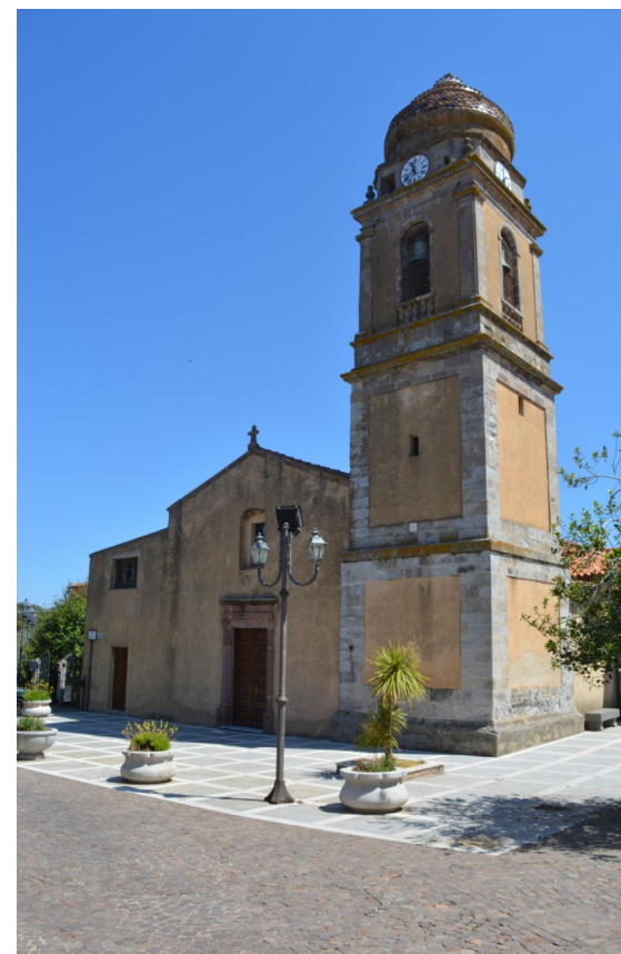
The Parish Church of St. Andrew with the bell tower